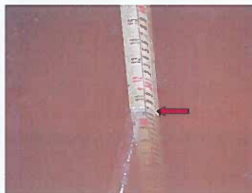
Day 2: Depth of water level: 370mm