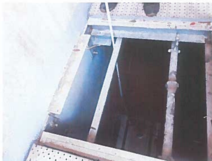
Oil Filled Auxiliary Transformer Bund wall below gratings